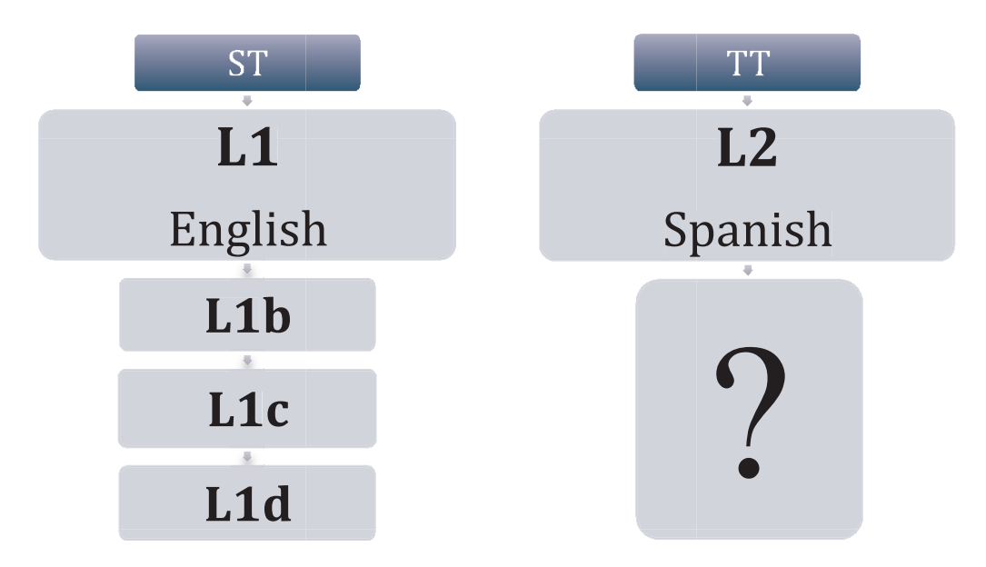
Figure 1. Representation of the third language in the ST

These two examples have been taken from the guidebook of Morocco. The first one's third language is Moroccan ("haram"), which has been included in the ST with an equivalent of the word in English (L1). Moroccan is, therefore, the third language (L1b). The second example, on the other hand, includes two different third languages: Spanish (L1c) and French (L1d), for which an equivalent in the L1 has not been included.